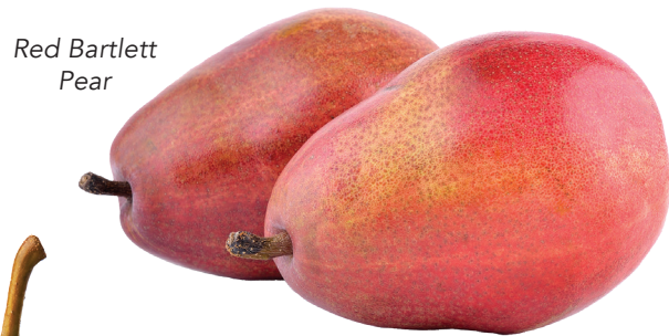
Red Bartlett Pear